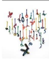
A Collection of Numbers (sculpture) by Ethan, aged 5

Have a look at the previous exhibitions on our website to give you some inspiration and here are some good examples of original ideas and interesting descriptions to get you started.