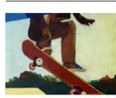
Here Comes the Kickflip (painting) by Oskar, aged 11

A collection of numbers were having a lovely day, when bad guy 7, comes along to eat them. But never mind, superhero 1 is going to save the day!